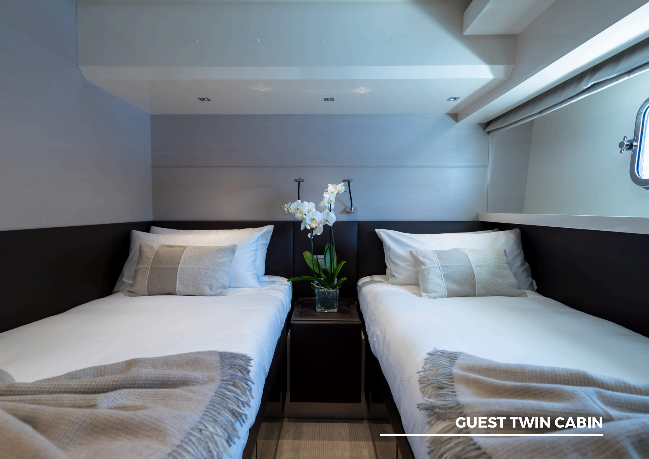
GUEST TWIN CABIN