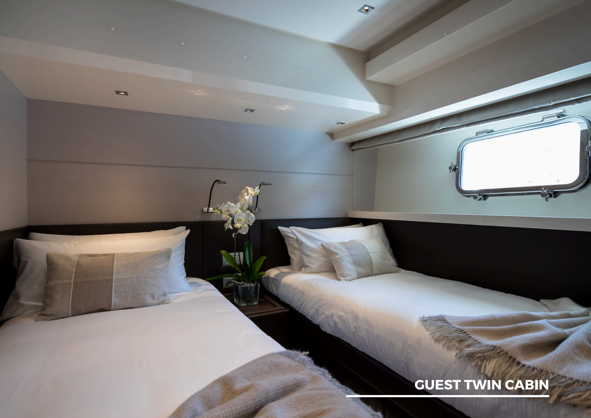
GUEST TWIN CABIN