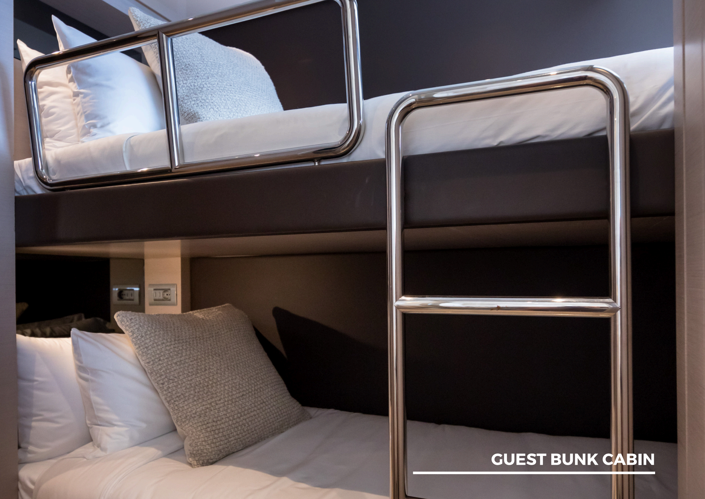
GUEST BUNK CABIN