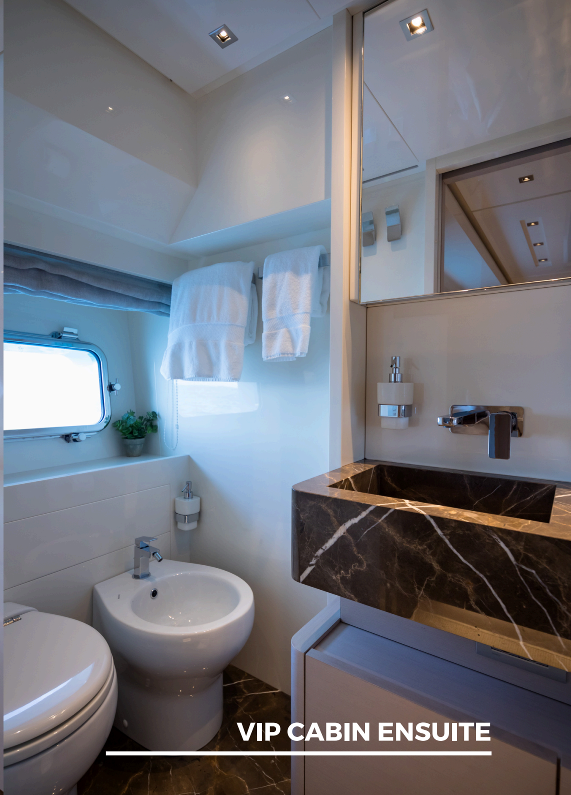
VIP CABIN ENSUITE