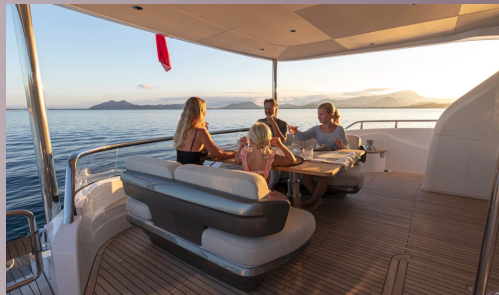
Cockpit dining area