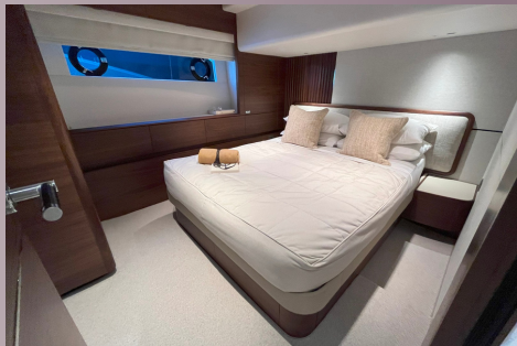
VIP guest cabin