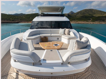
Bow seating area