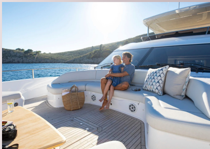
Bow seating area