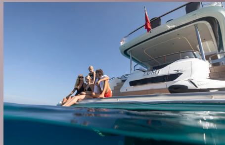
Hydraulic swim platform