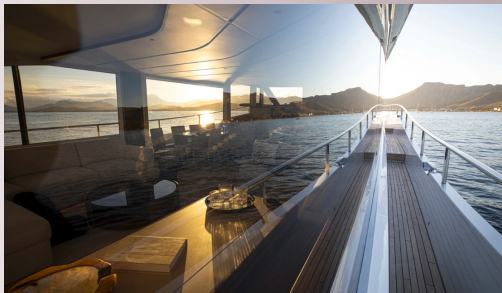
Teak side decks